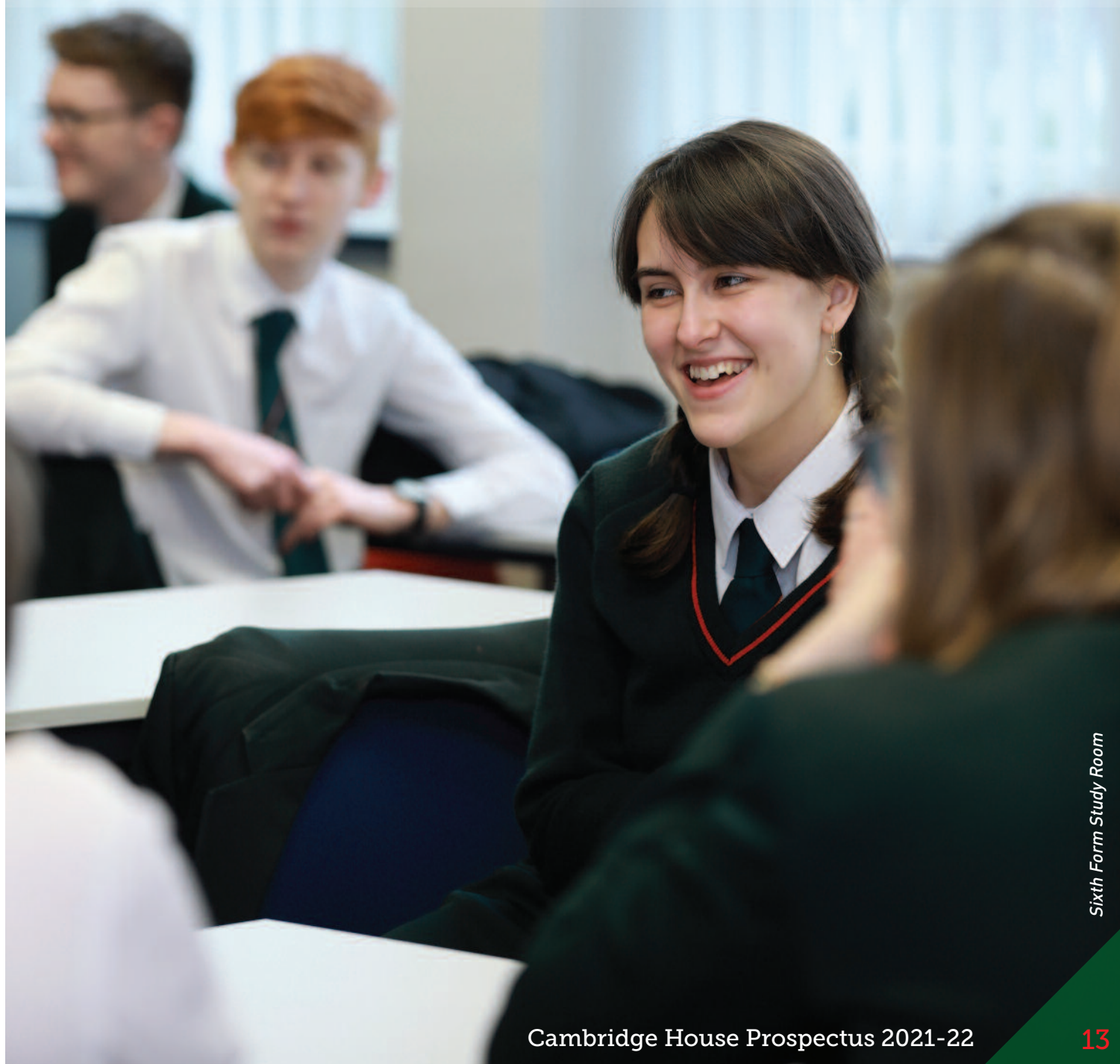
Sixth Form Study Room