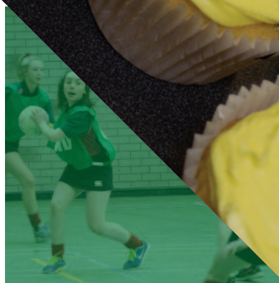
Charity Cup Cake Competition