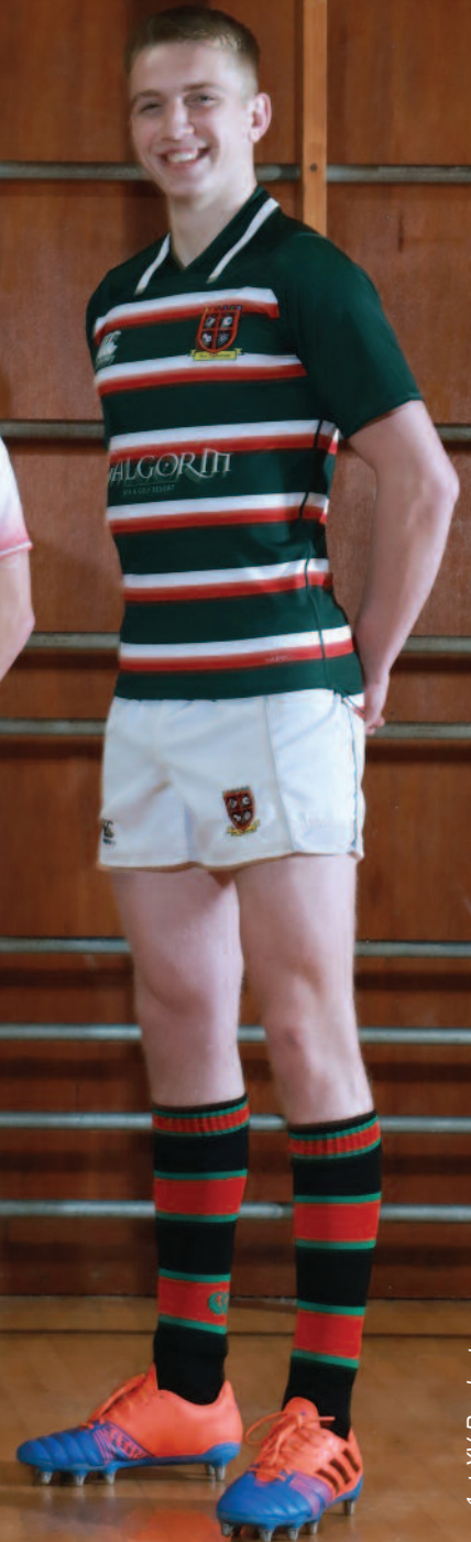
Ulster U18 Rugby squad